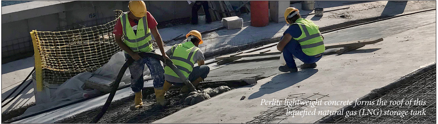
Perlite lightweight concrete forms the roof of this liquefied natural gas (LNG) storage tank