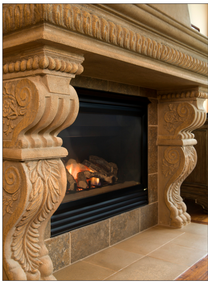
Perlite cultured stone and gas fireplace logs