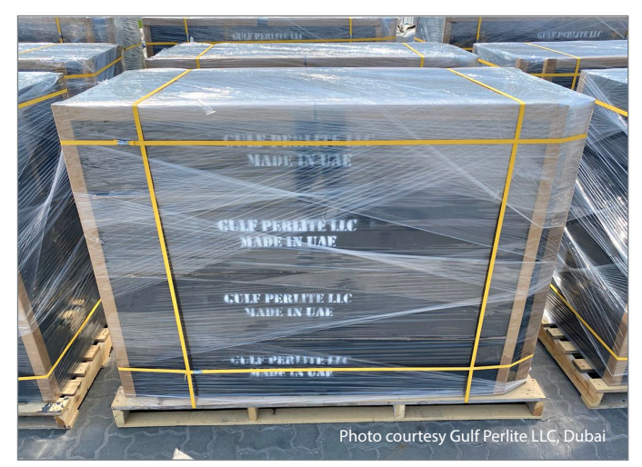
Figure 1 (above) • A Perlite Concrete Block (PCB) palletized and ready for shipment

The reinforcement specifications for Perlite Concrete Blocks vary depending on the loads involved and dimensions of the blocks needed. The specifications